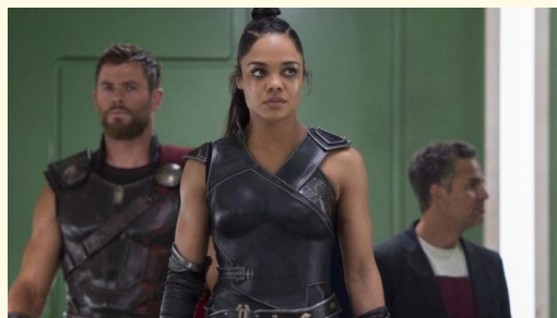
Valkyrie's (centre) bisexuality is not mentioned in Thor: Ragnarok