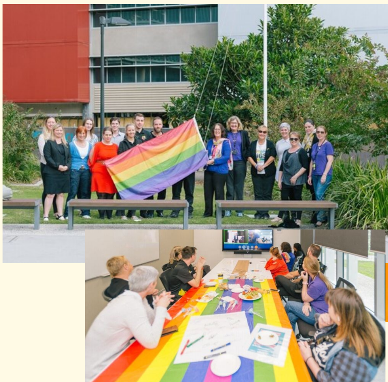
Springfield campus staff and students celebrating IDAHOBIT