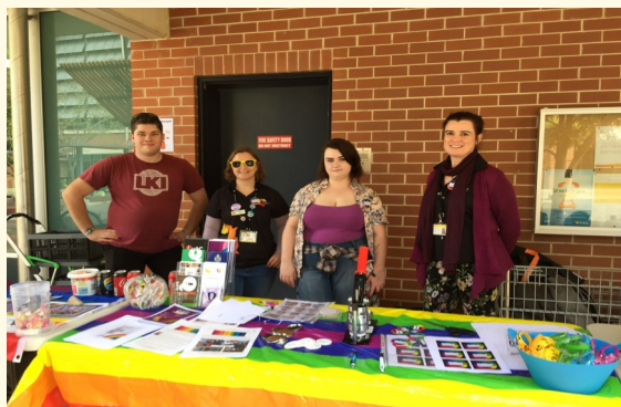
IPSWICH WEAR IT PURPLE DAY