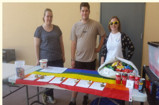
SPRINGFIELD BI VISIBILITY DAY

September already and soon it will be Christmas! Hopefully everyone has plans for some R&R in coming months, it's been a big year. Allies across the three USQ campuses have been attending events to promote, support and embrace LGBTIQ staff and students. Wear it Purple Day, Bi Visibility Day were celebrated recently. Toowoomba's Wear it Purple Day encouraged visitors to the stall to write messages of support to LGBTIQ youth. We had an overwhelmingly positive response. Some of the statements included "You are loved!" and "You are important" and "It gets better". Messages of support and hope from our community. We would love to expand on this for next year, encouraging all areas of the university to live out the values of diversity and inclusion.